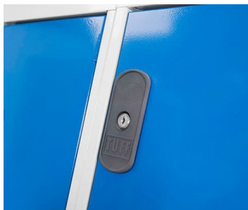
Close up TUFF lock