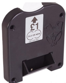
Coin return lock